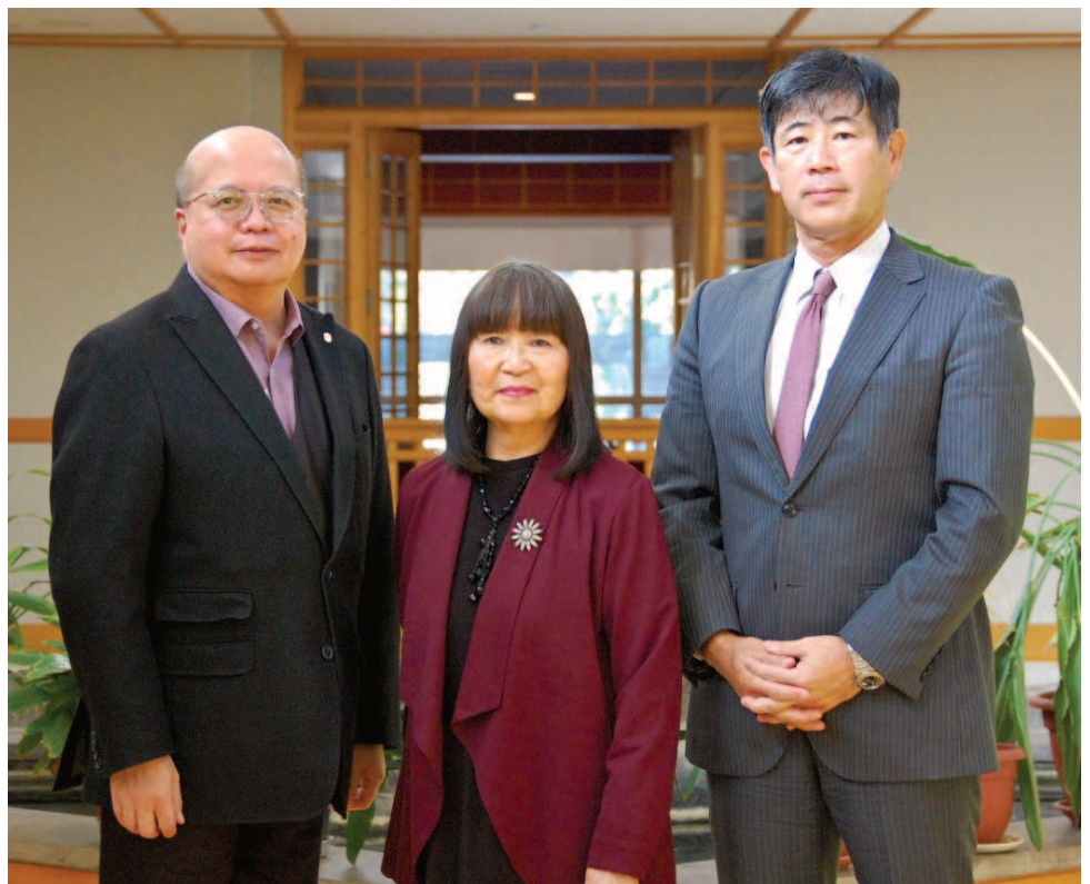
(L to R)